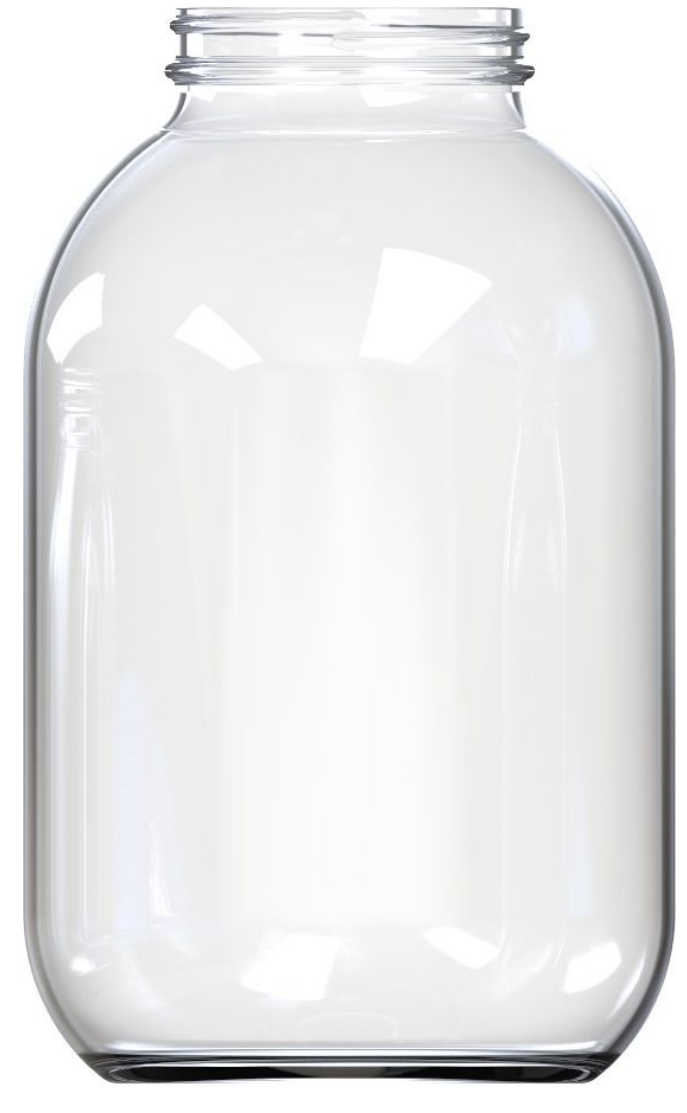
FLINT - INDUSTRIAL 1200 F42003701