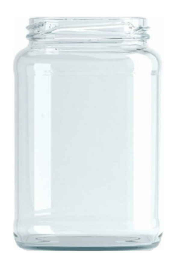
FLINT - INDUSTRIAL 1200 F42004743