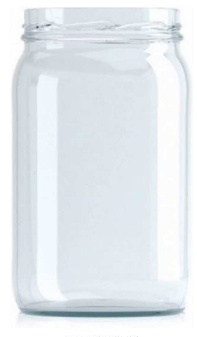
FLINT - INDUSTRIAL 1200 F42004764