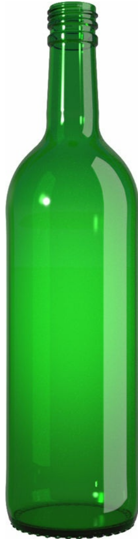
EMERALD GREEN G92202369