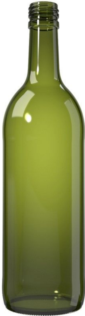
UV GREEN N72202369