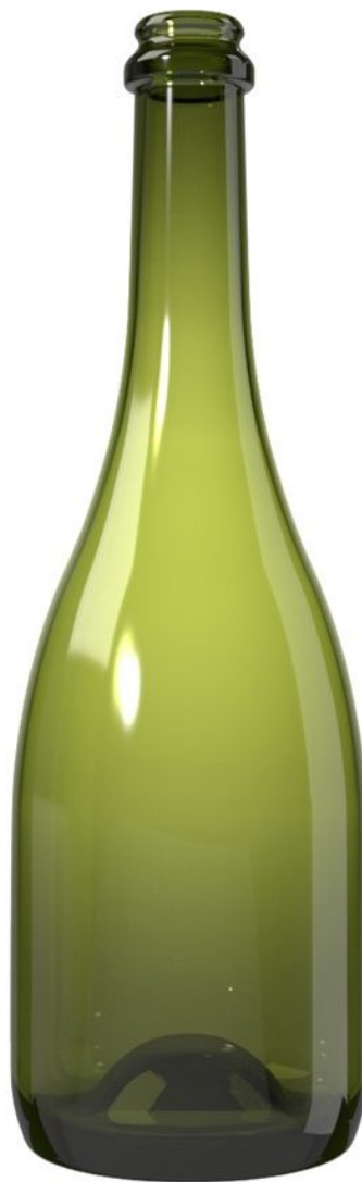
UV GREEN N72005765