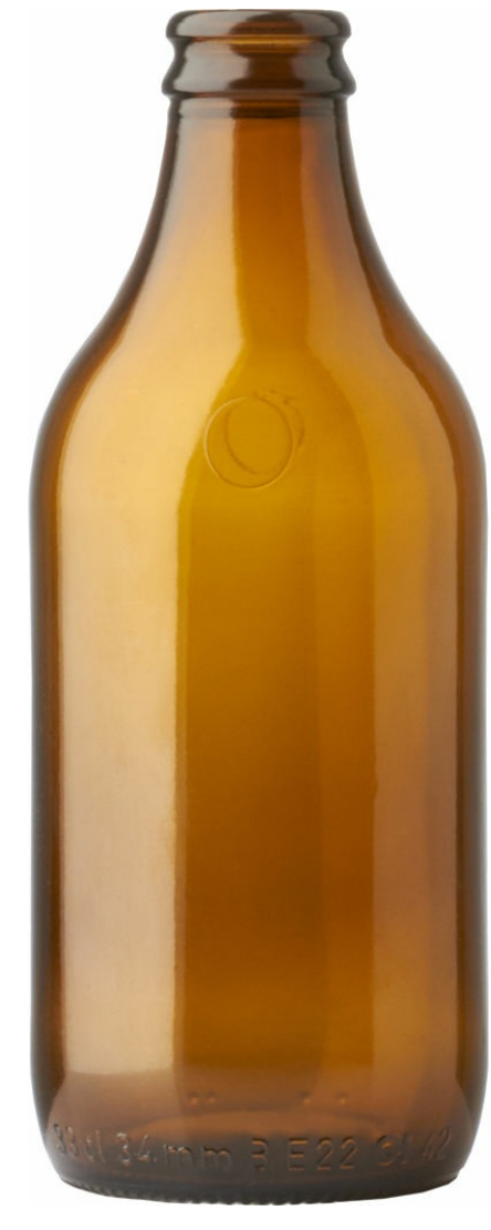
AMBER DARK A2004782