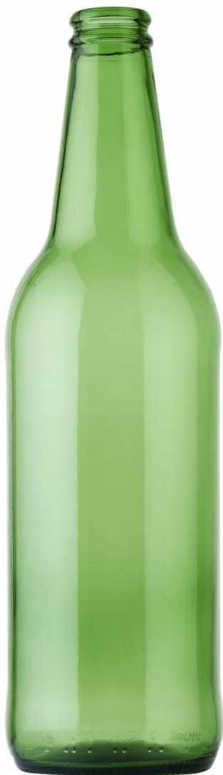
GREEN BEER EMERALD