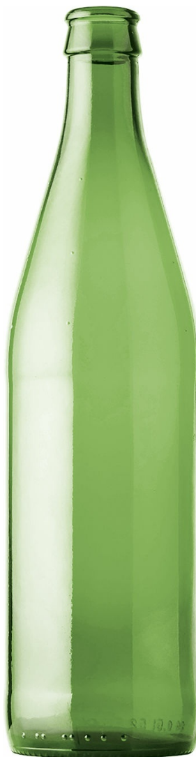
GREEN BEER EMERALD