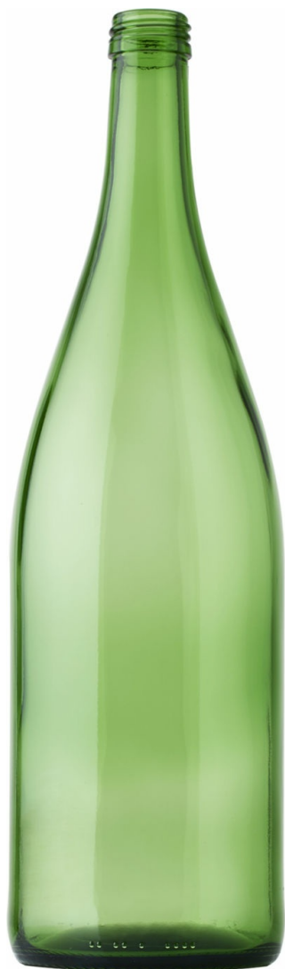
GREEN BEER EMERALD