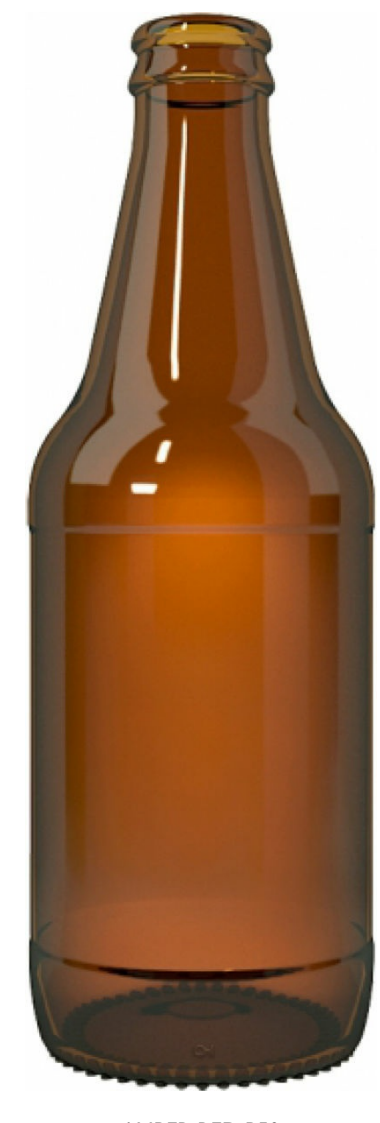
AMBER RED B50 A22201153