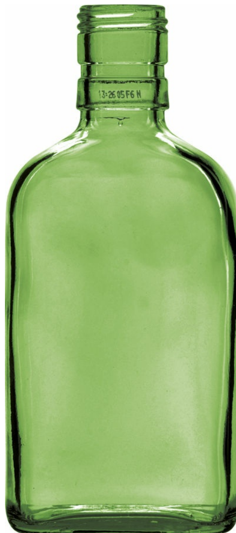
GREEN STANDARD G5001 I 40