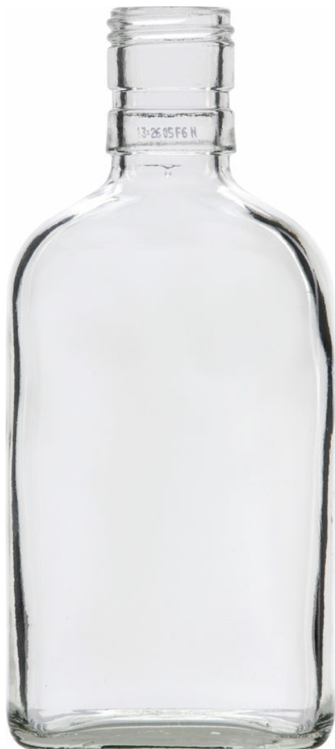
FLINT F3001 I 40