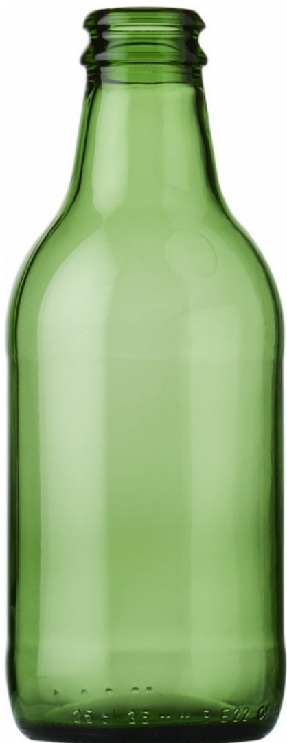
GREEN BEER EMERALD