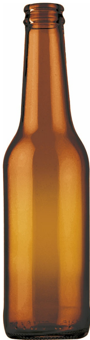
AMBER RED A3005171