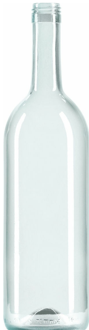
HALF FLINT F2008090