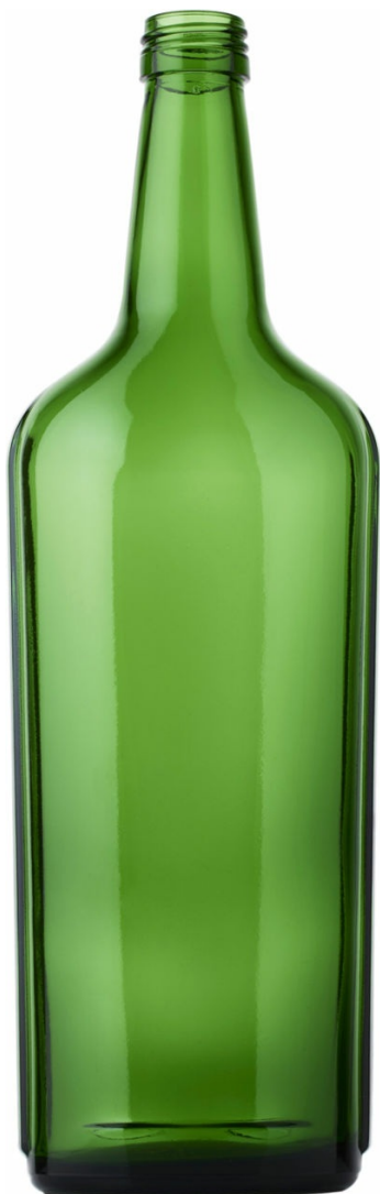
GREEN BEER EMERALD