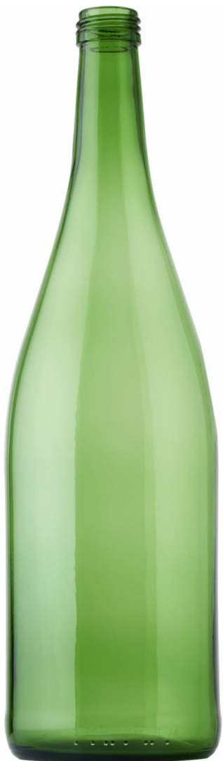
GREEN BEER EMERALD