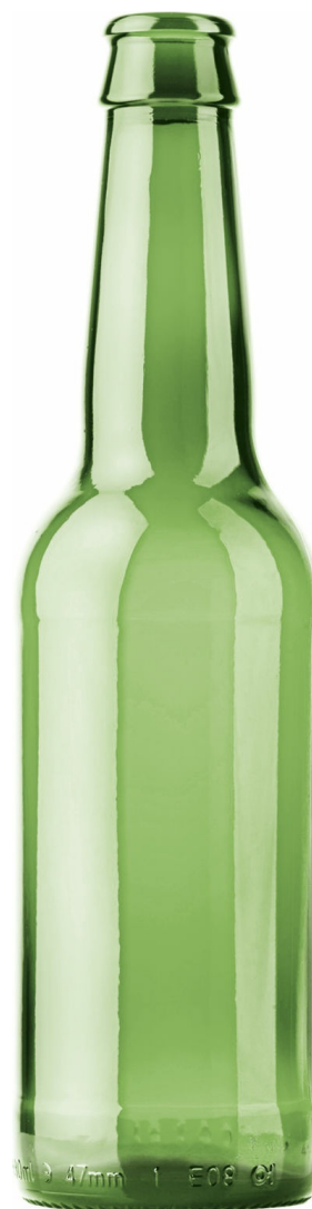
GREEN BEER EMERALD