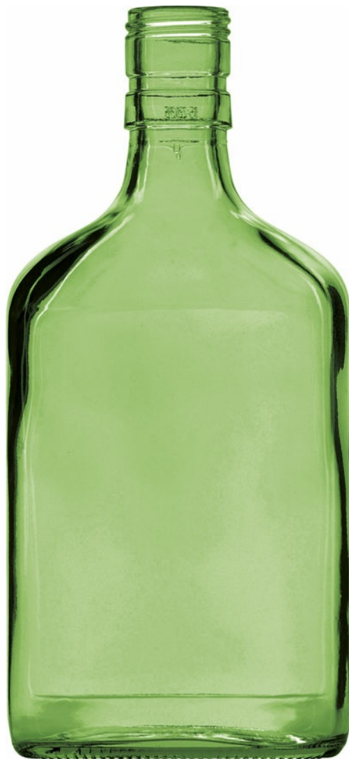
GREEN STANDARD G5001147