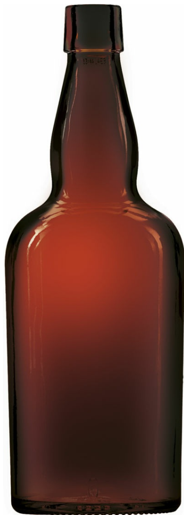
AMBER DARK A2001435