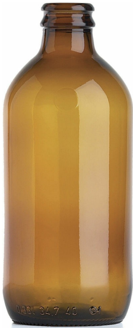
AMBER BEER A1003260