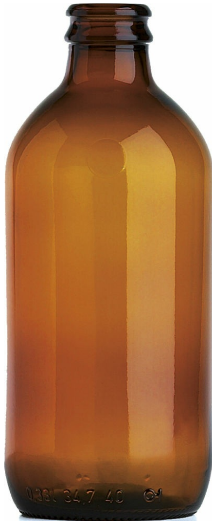
AMBER RED A3003260