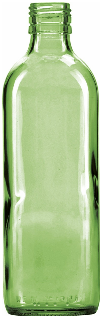
GREEN BEER EMERALD G3003467