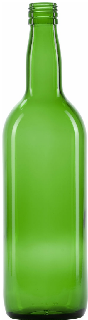
GREEN BEER EMERALD