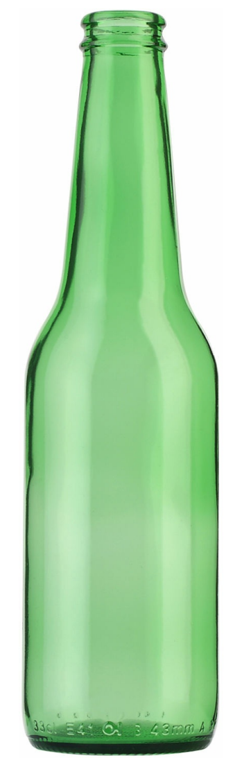
GREEN BEER EMERALD G3007089