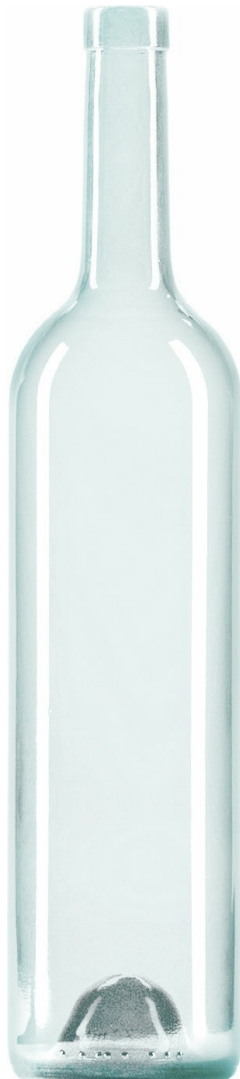
HALF FLINT F2007295