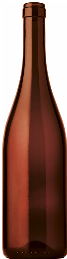
AMBER DARK A2007328