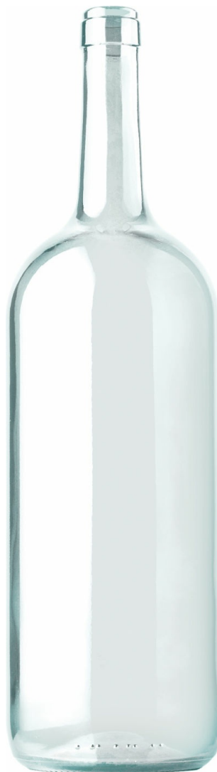
HALF FLINT F2007498