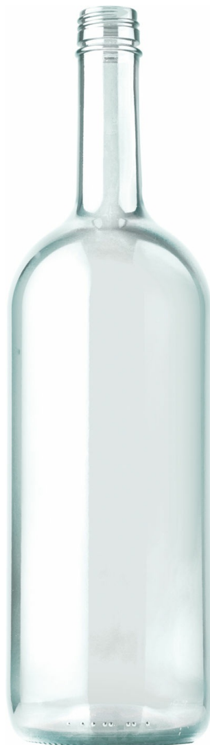
HALF FLINT F2007500