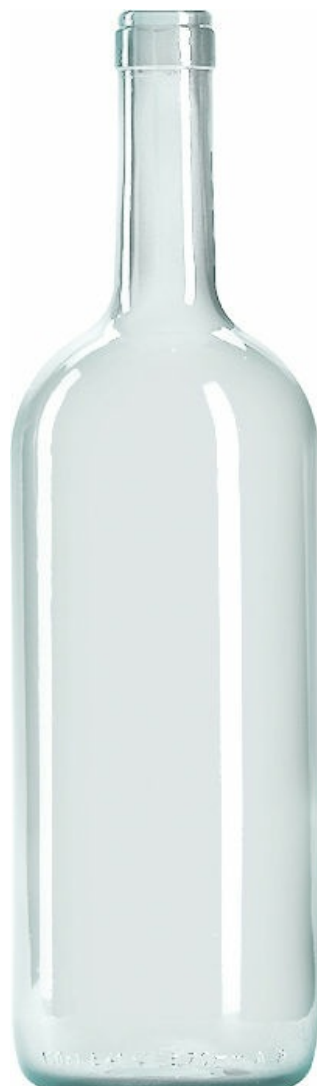
HALF FLINT F2007501