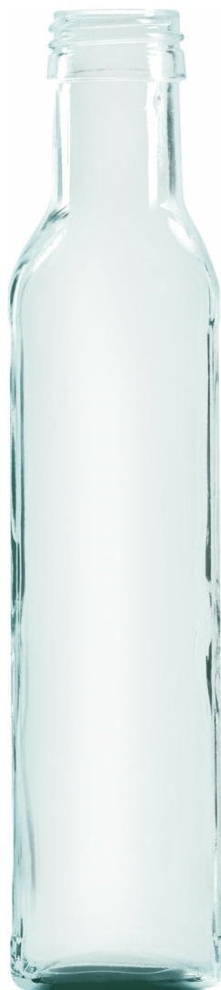
HALF FLINT F2008108