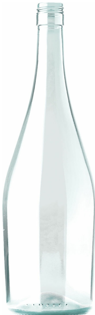
HALF FLINT F2008219