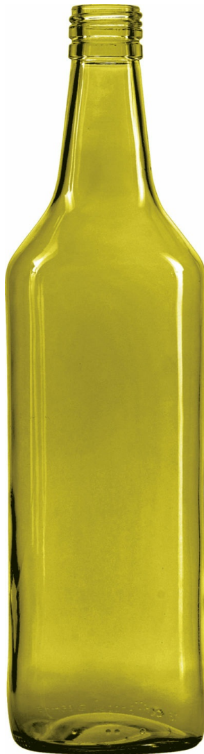
DEAD LEAF LI012633