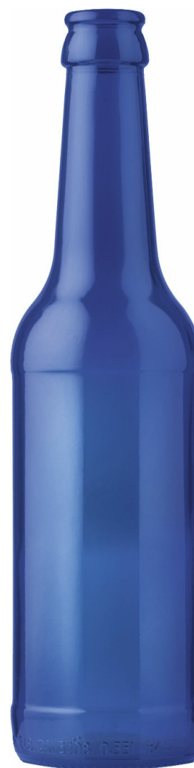
LUXURY ROYAL BLUE