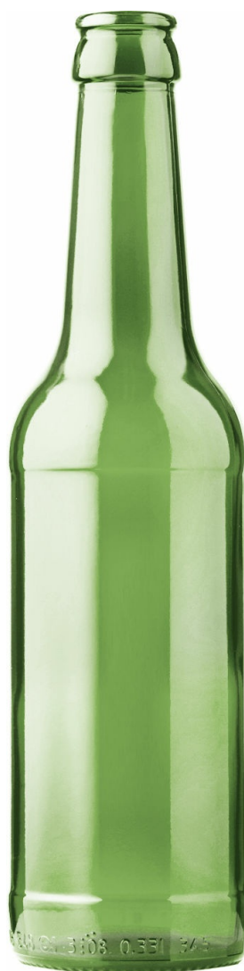
GREEN BEER EMERALD