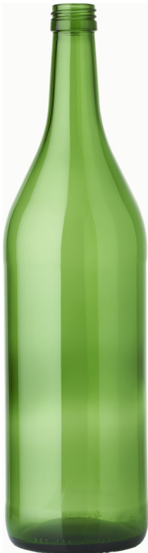
GREEN BEER EMERALD