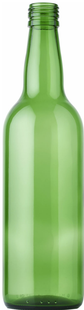
GREEN BEER EMERALD