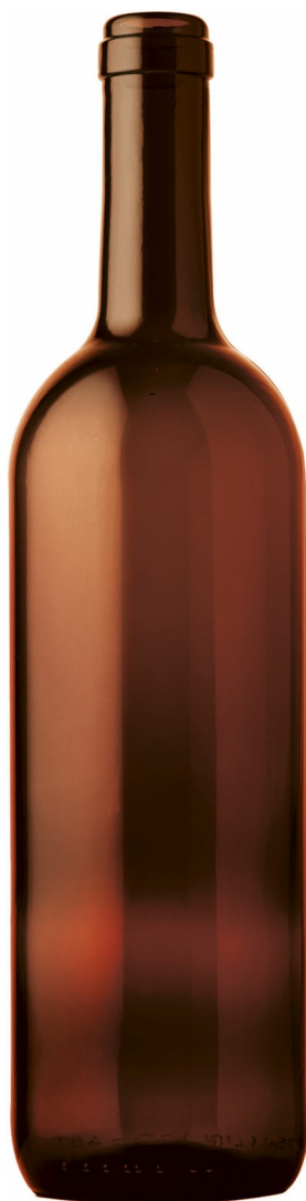
AMBER DARK A2110186