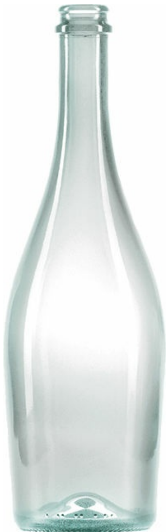
HALF FLINT F2110385