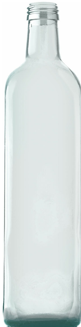
HALF FLINT F2120173