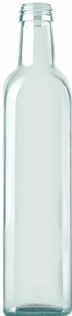
HALF FLINT F2120352