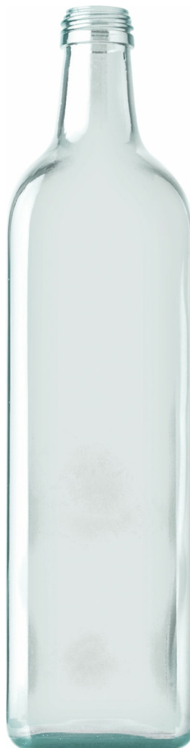
HALF FLINT F2120361