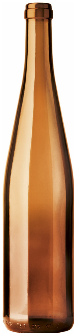
AMBER BEER A1120503