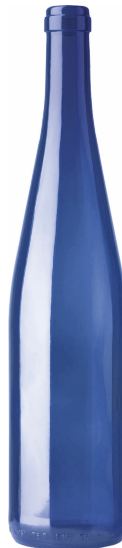
LUXURY ROYAL BLUE S0120503