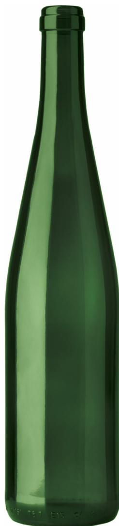
MASSON (VERY DARK GREEN) G1120503