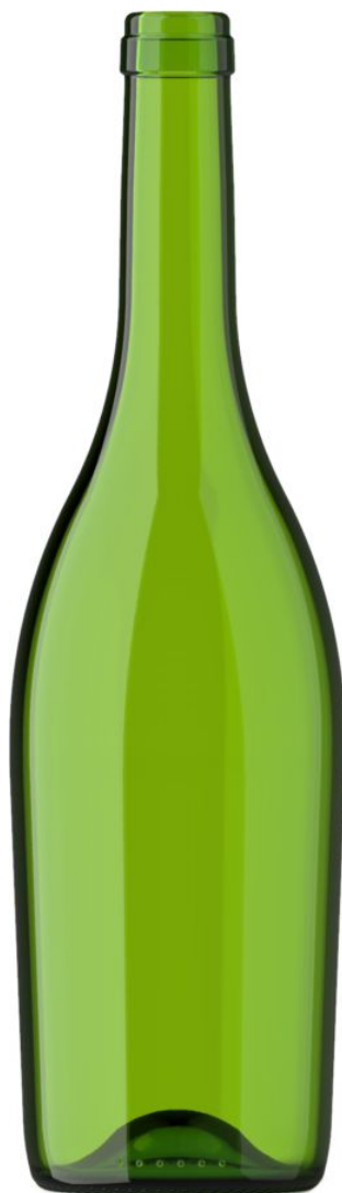
CHAMPAGNE GREEN G6150887