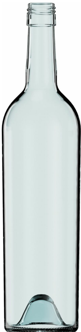
HALF FLINT F2200522