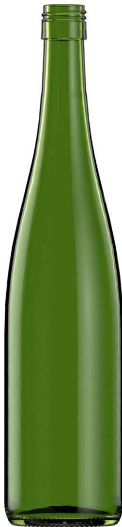
CHAMPAGNE GREEN G6250145