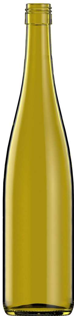
DEAD LEAF L1250145