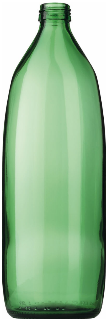
GREEN BEER EMERALD