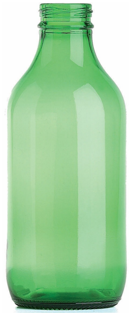
GREEN BEER EMERALD