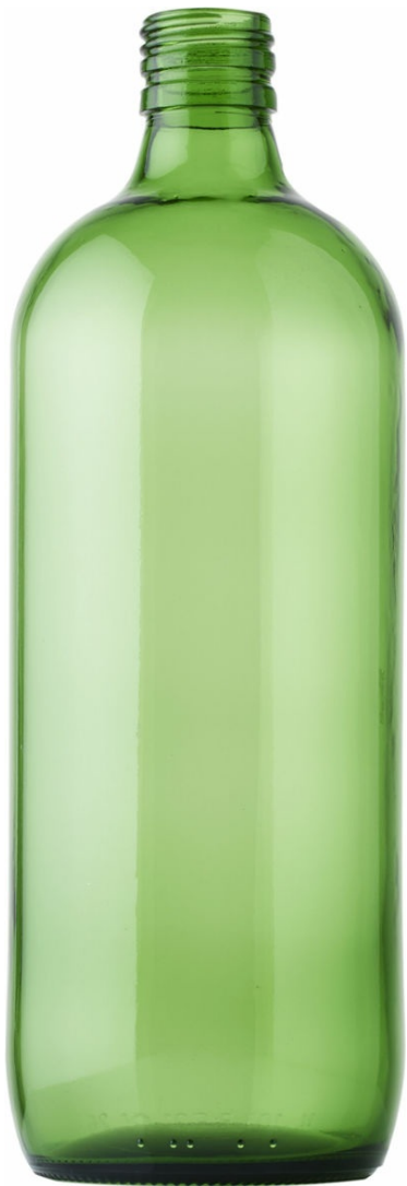
GREEN BEER EMERALD