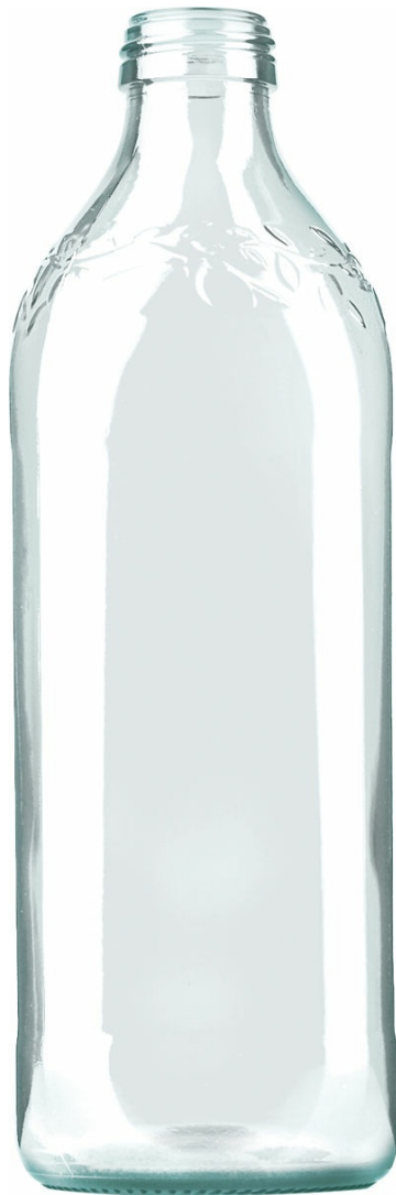
HALF FLINT F2007466