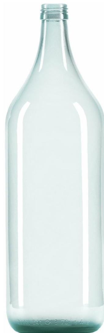
HALF FLINT F2007521