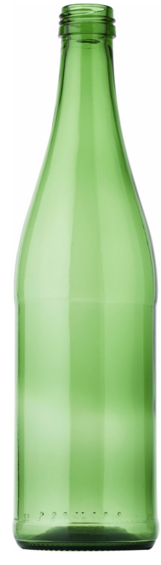
GREEN BEER EMERALD G3008264