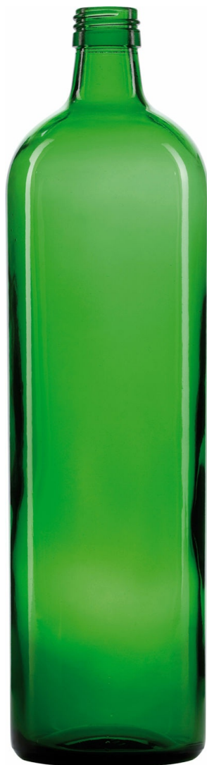
GREEN BEER EMERALD